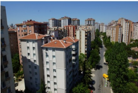
2 yatak odalı dubleks 147 m2